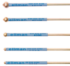
Cat. No. XD