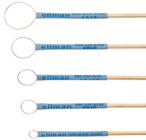
Cat. No. XB