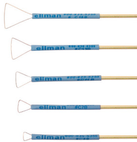
Cat. No. XT