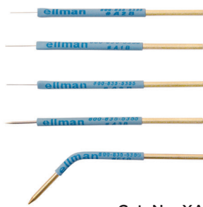
Cat. No. XA

All Ellman® electrodes are designed for use in high frequency (4 MHz) RF Generators. The insulated shafts can be bent or contoured to facilitate use in various surgical procedures.