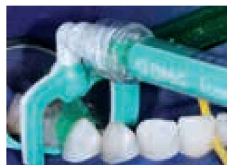
Etching with Icon-Etch.

Icon proximal – treat earlier, preserve longer.