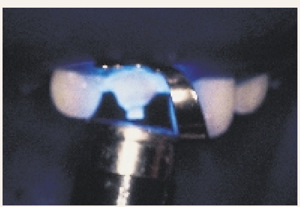
Figure 8—Post cemented in root canal and light-cured.