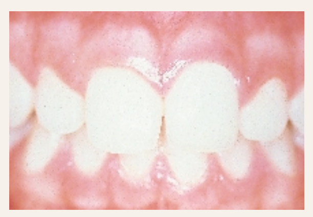
Figure 11—Cemented In-Ceram Spinell crown.