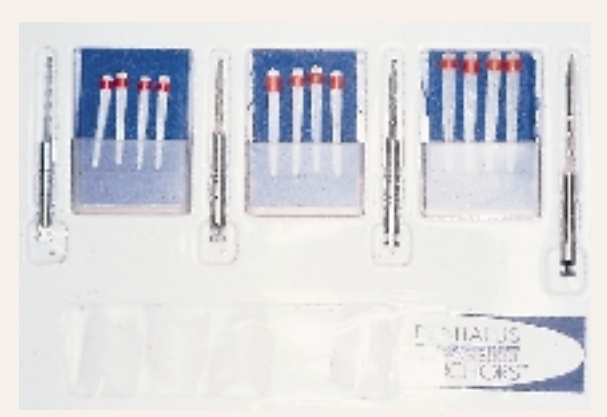
Figure 1 —Light-transmitting, fiber-reinforced resin Luscent Anchor System.

When choosing an esthetic post system, there are a number of criteria the post must meet to guarantee clinical success. These include: