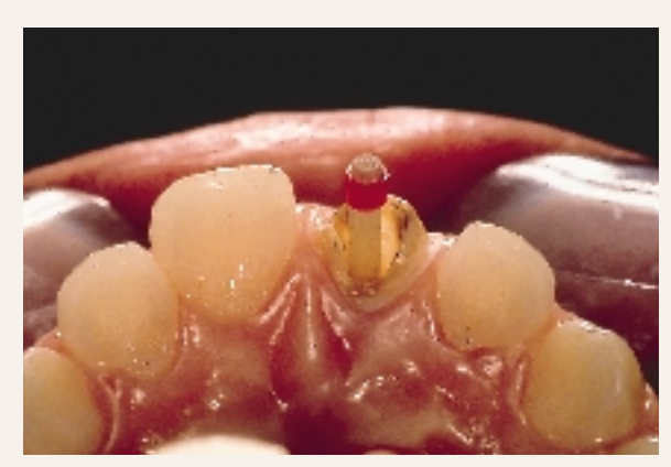
Figure 6b—The Luscent anchor is tried-in; lingual view