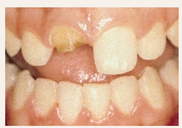
Figure 4 —View with temporary crown removed. Note that at least one quarter of the crown remains.