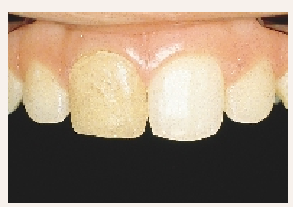
Figure 2 —Acrylic resin temporary crown on maxillary central incisor.