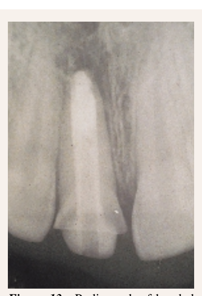
Figure 13—Radiograph of bonded Luscent Anchor within the root canal

evidence of the shadowing that is typically seen with metal and opaque white posts. The final radiograph demonstrates the bonded resin reinforcement afforded by placement of the Luscent Anchor (Figure 13).