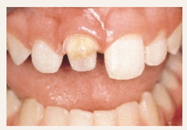
Figure 10—Completed crown preparation.