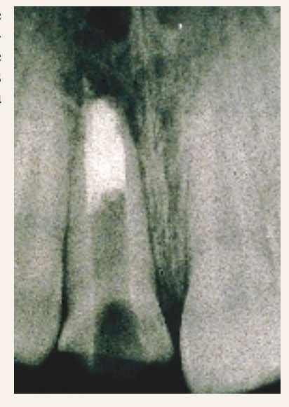
Figure 5—The gutta percha removal from the root canal is verified with a radiograph.