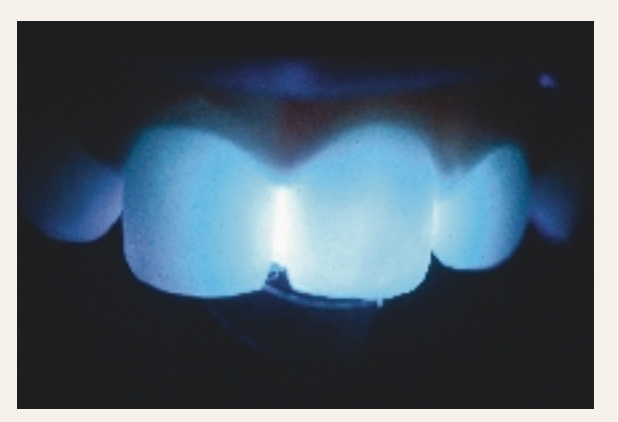
Figure 12 —Translucency of all-ceramic crown with translucent Luscent Anchor visible transillumination.

nonvital before the recent accident, because of the large, flared root canal that was present. After a thorough clinical examination, it was determined that at least one quarter of the coronal tooth structure remained, and it could be restored with a bonded post and core and esthetic bonded crown to maximize tooth reinforcement.