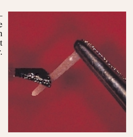
Figure 7— Resin adhesive is painted on the Luscent Anchor.