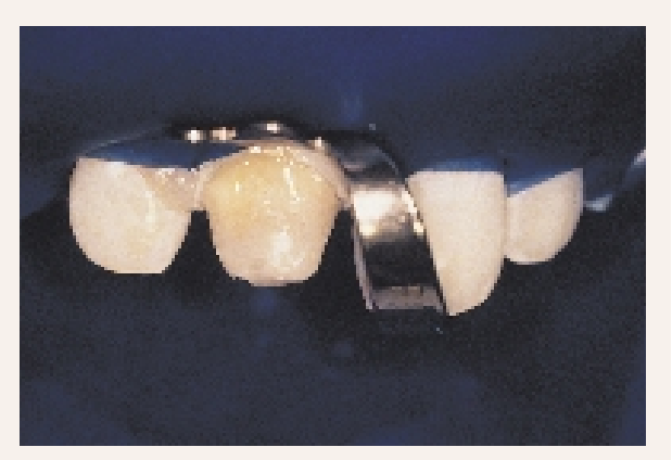
Figure 9—Composite resin core placed.