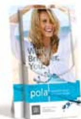
Pola Patient Handout Stand Reorder M100041