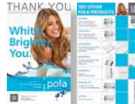
Pola Thank You Card Reorder M770032