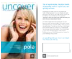
Pola Statement Stuffer Reorder M770229