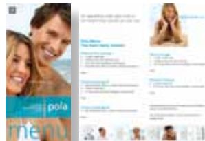
Pola Menu Reorder M770030