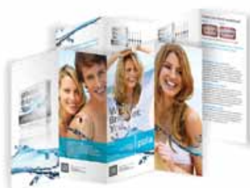
Pola Patient Handouts Reorder M100122