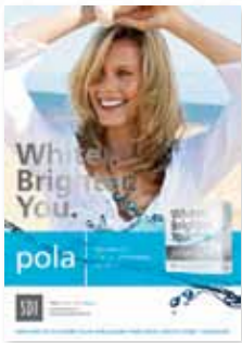
Pola Poster female only Reorder M100060