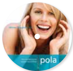
Pola Office waiting room demonstration DVD Reorder M770985