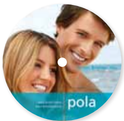
Pola Office professional demonstration DVD Reorder M770954