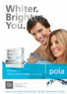
Pola Poster female and male Reorder M100051