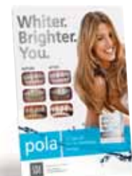
Pola Before & After Stand Reorder M100044