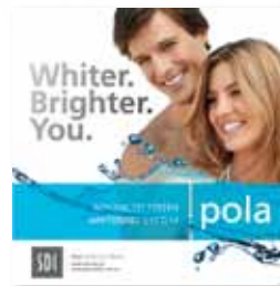
Pola Ceiling Tile Reorder M100065