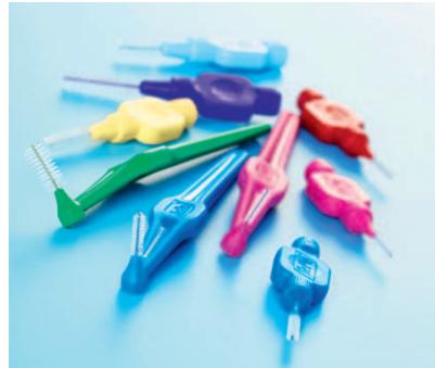
TePe Interdental Brushes Choice of size, texture and design