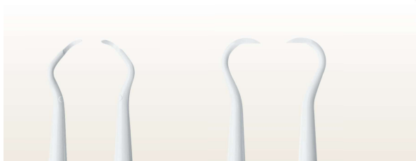
204S 20% THINNER!