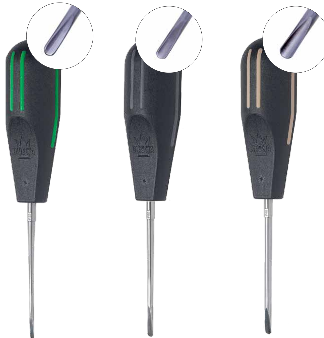
F25 Forte 2.5 mm Straight Standard