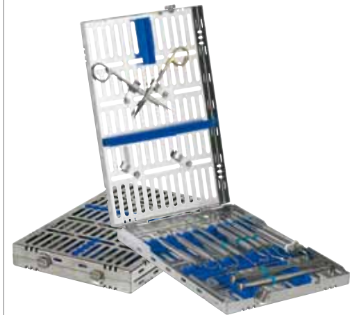
IMDIN13_S DIN Cassette for 18 Instruments